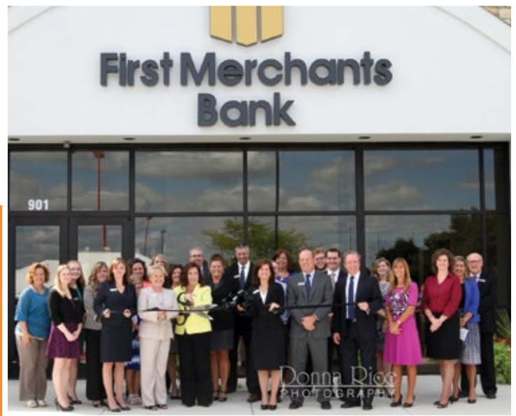
First Merchants Bank opened a new branch in Greenwood to relocate and expand their growing operations.

November 2015, Metropolitan Indianapolis Board of Realtors