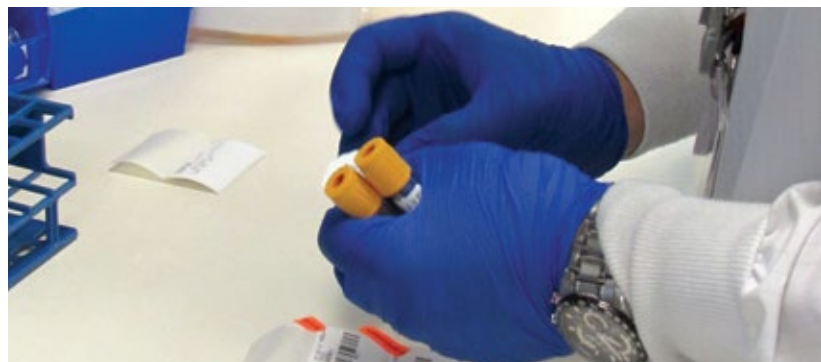
The modern and fully automated lab services offered by Franciscan St. Francis Health-Indianapolis offers patients efficient and accurate results.